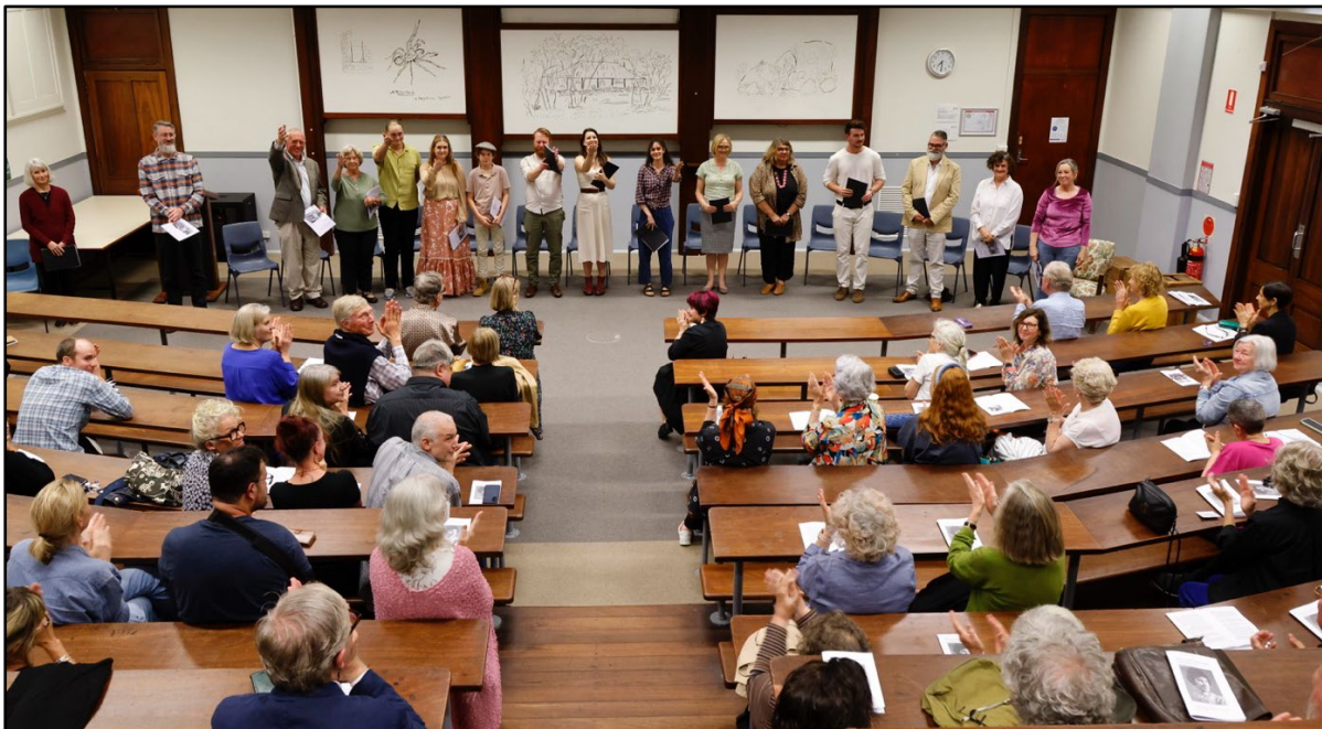
Figure 7: The actors take their bow as the audience applauds.

coaxed wonderful memories ... so evocative in creating a memory of warm afternoons, bush walks and of finding the shiny gooey gum on the jam trees, hardened on the outside by the sun but soft and chewy on the inside”. (S Winfield, personal communication, October 7, 2023)