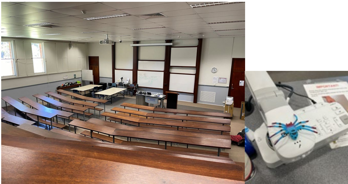
Figures 1 & 2: G20 Lecture Theatre, The University of Western Australia, 2023.

Kershaw and Nicholson note that “Performance happens in more types of theatres than ever before, and in many other places than in theatres” (2011, p. 14), while McLucas (2000) points out that site acts as “host” for the “work that theatre makers create” (cited in Wilkie, 2004, p. 97). It was now our task to find a venue at the Park Avenue site which might be suitable for the reading. Initially, we considered one of the many grassed areas at Park Avenue which are backed by Kings Park and overlook the Swan River, but were concerned about possible inclement weather and the lack of lighting and amplification. We then visited the G20 Lecture Theatre which is now used for podiatry lectures. Remarkably, apart from the (removable) technical desk, it has remained virtually unchanged for almost a century. Whiteboards have been inserted into the original frames which once held blackboards, but the string pulley system for those boards still functions and the original desks, benches and shutters on the windows remain. Despite the “inherent aesthetic limitations” (Paget, 2010, p. 181) arising from the lack of theatrical technical capacity, the raked seating and clear space on the floor at the front of the lecture theatre suggested that this would be a suitable space to host the performance and celebrate the historicity of the site. In case we remained in any doubt, on this, our first visit to the lecture theatre, we even encountered a plastic spider on the tech desk!