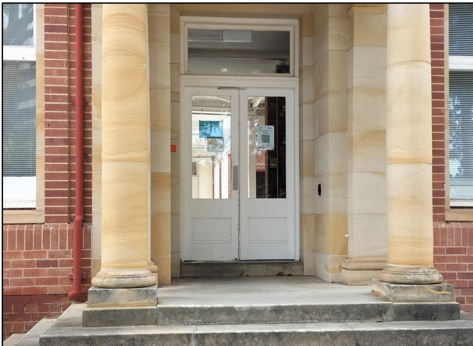
Figure 4: The same steps in 2023, through which the audience entered for the reading.