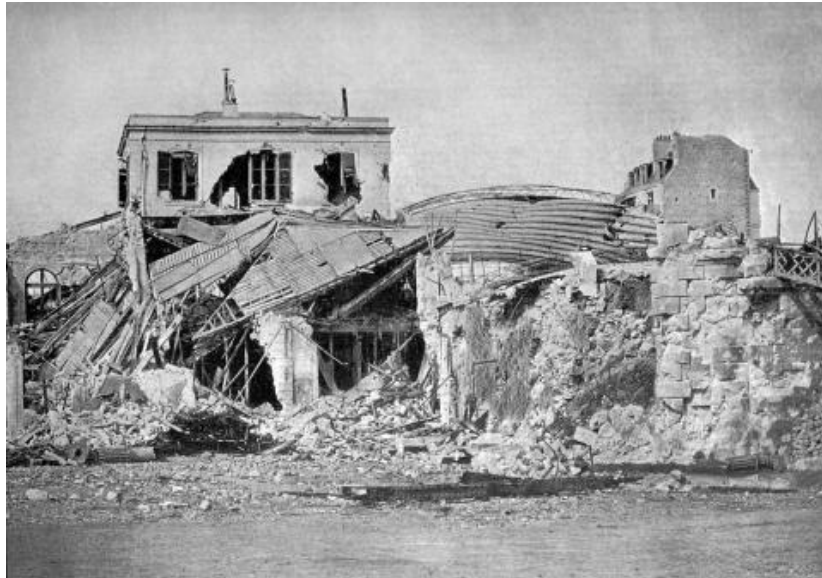
Figure 2. Anonymous photograph of the destruction of the Auteuil station

In 1868, Jules and Edmond relocated from their shared apartment in the center of Paris to a house just outside of the city walls in the suburb of Auteuil. Their home sat in a private garden community, laid out in the 1850s as part of a development along a new commuter light railway. However, what promised to be an aesthetic retreat (Periton 2004) came to be marked by significant personal and political crisis. The brothers only lived together in their new home for two years before the younger sibling died of syphilis, and, within less than a year of his brother's death, Edmond had to relocate all of their collections in advance of the Paris Commune (1871). The Auteuil station was severely damaged during the Commune (Figure 2).