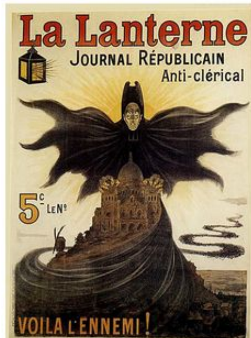
Figure 1. Eugene Oge, poster for La Lanterne , 1902

For Houellebecq the architectural allusions suggest a larger decadence. Indeed, by the end of the nineteenth century in Paris, buildings such as the Sacré-Coeur basilica were ripe polemical symbols in the ongoing conflict between Republicans and Catholic royalists that continued from the time of the French Revolution to at least the 1905 separation of church and state in France. The socio-political debates of the late nineteenth century were steeped in the rhetoric of decadence. From the streets of Paris, one could see the elongated profile of Sacré-Coeur’s dome, its Byzantine style and white travertine, which resists discoloration of weather and pollution, as evidence of its attempt to atone for the decadence of modern culture. On those same streets, one might also see a poster depicting a vampire-like cleric gripping the basilica and casting its own decadent shadow over the white stone of the church (Figure 1).